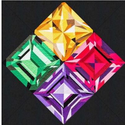
4 Gems – WITHOUT Sashing

Dimensions: 51" x 51" WITHOUT Sashing; 52" x 52" WITH Sashing