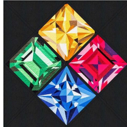
4 Gems – WITH Sashing